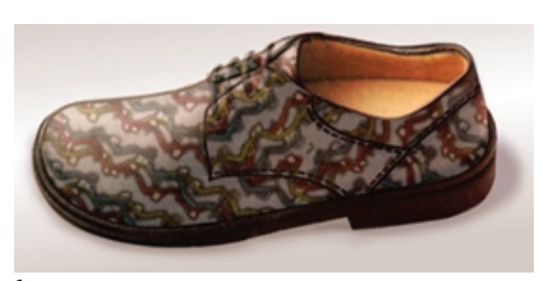
1 Halpine's image, Vegan Leather Shoe , is a visual pun. The shoe is printed with molecular models of the protein collagen, the main component of leather.

While at the gallery, Halpine noticed the work of Lorenzo Lotto,